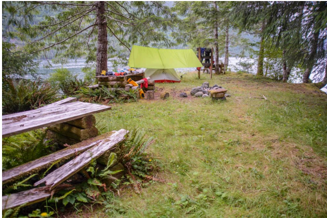
Before (picnic table)