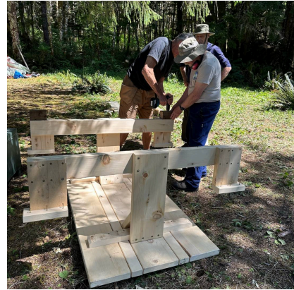
After (picnic table)