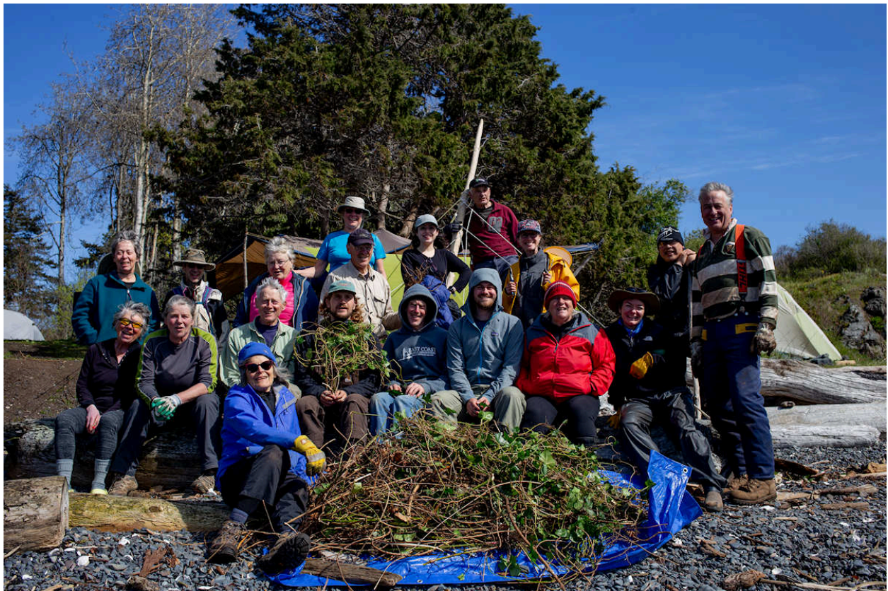
Volunteer crew, April, 2024